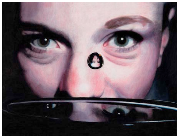
Three Self Portraits

won a national medal – for the most prestigious art show in the nation (the first TCA student so honored) won a Gold Key at the state level work displayed at Denver Art Museum